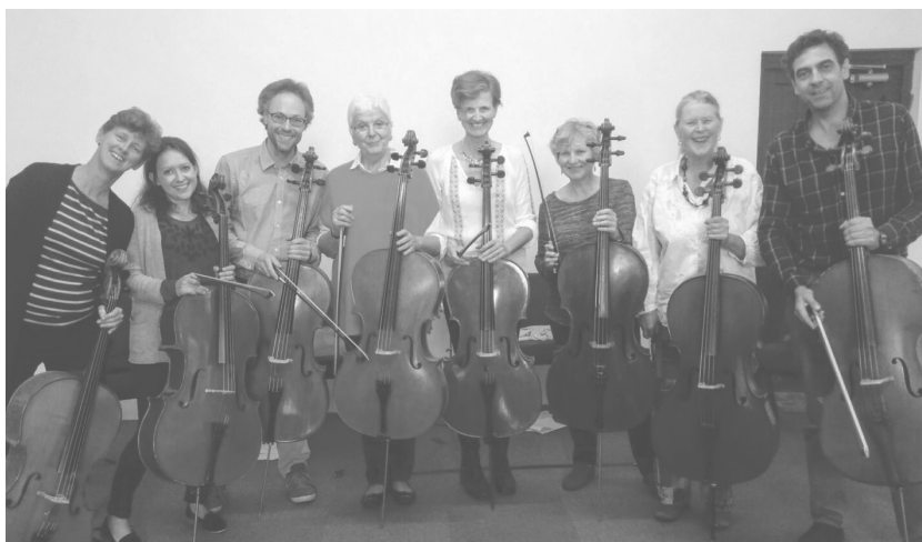
Members of the Cello Ensemble

D AVID WAS ALWAYS happy to help with arranging music for particular ensembles, no matter how unusual. Cornwall cello community was no exception. Over many years he has been helping to extend their repertoire of pieces for eight cellos. Whether Simpson's theme tune or