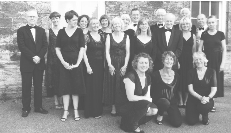
Members of St Mewan Sinfonia