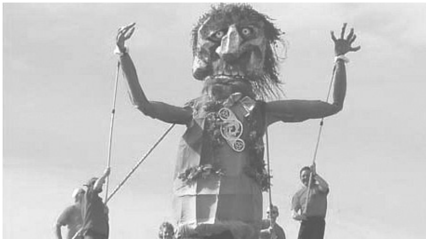
Giant Bolster parading through the streets of St Agnes in 2013